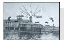
Maxim's Flying Machine (1904)